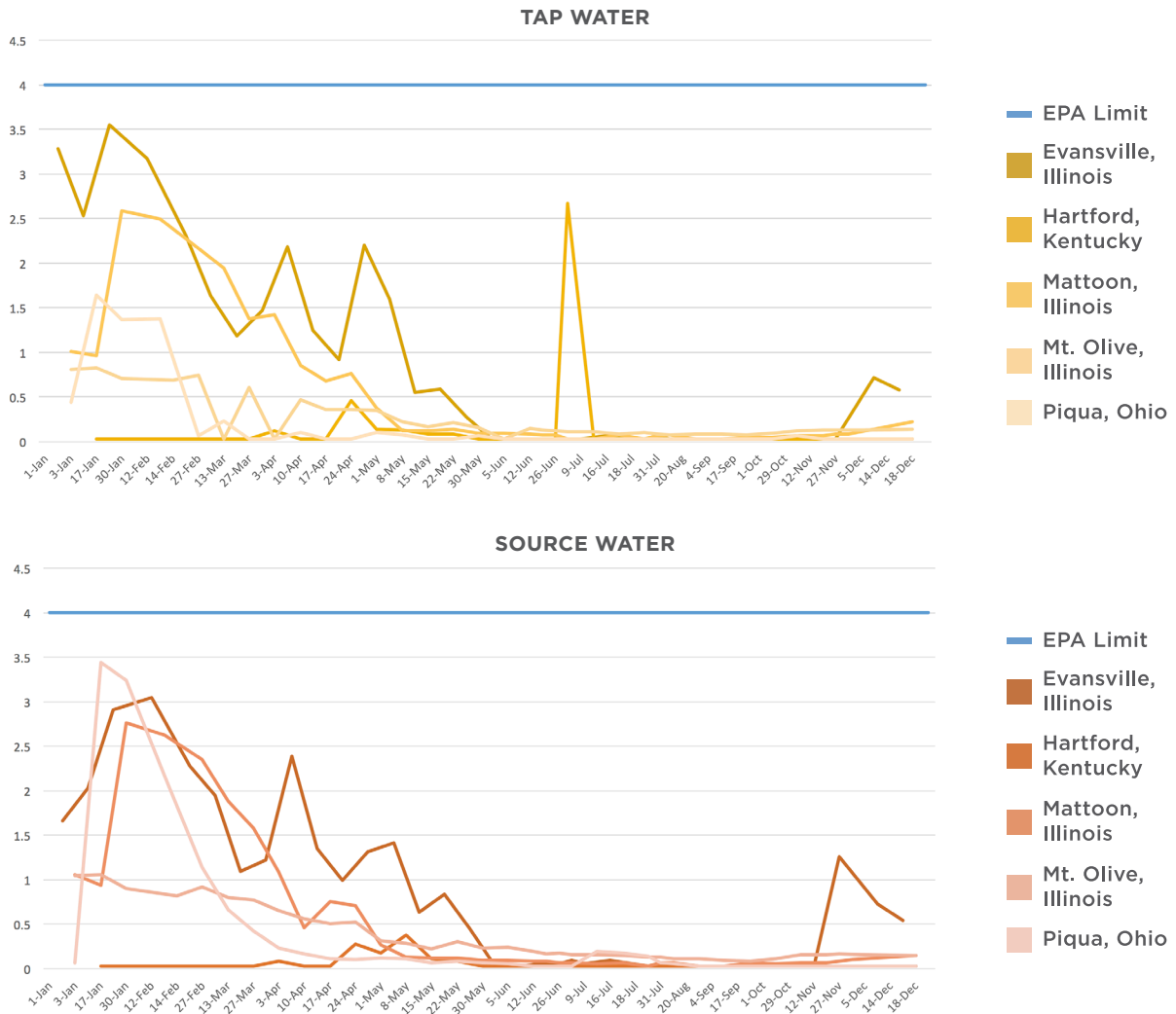
Figure 3: Tap water contaminated by simazine for months